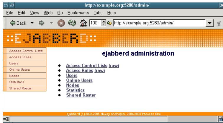
Figure 1: Top page from the web interface