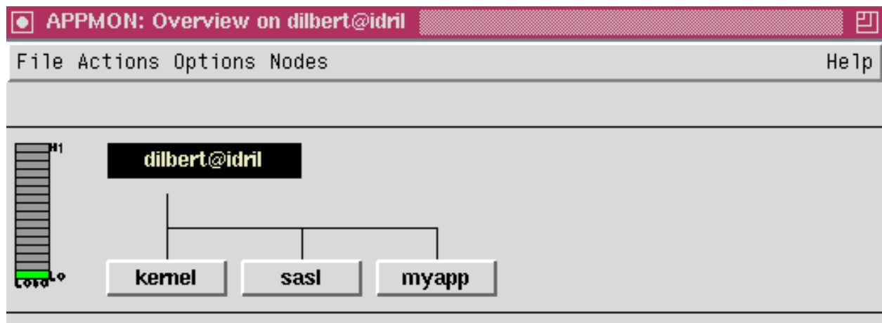
Figure 1.1: The Main Window.

The load meter shows load measured as processor time, or as the length of the ready queue.