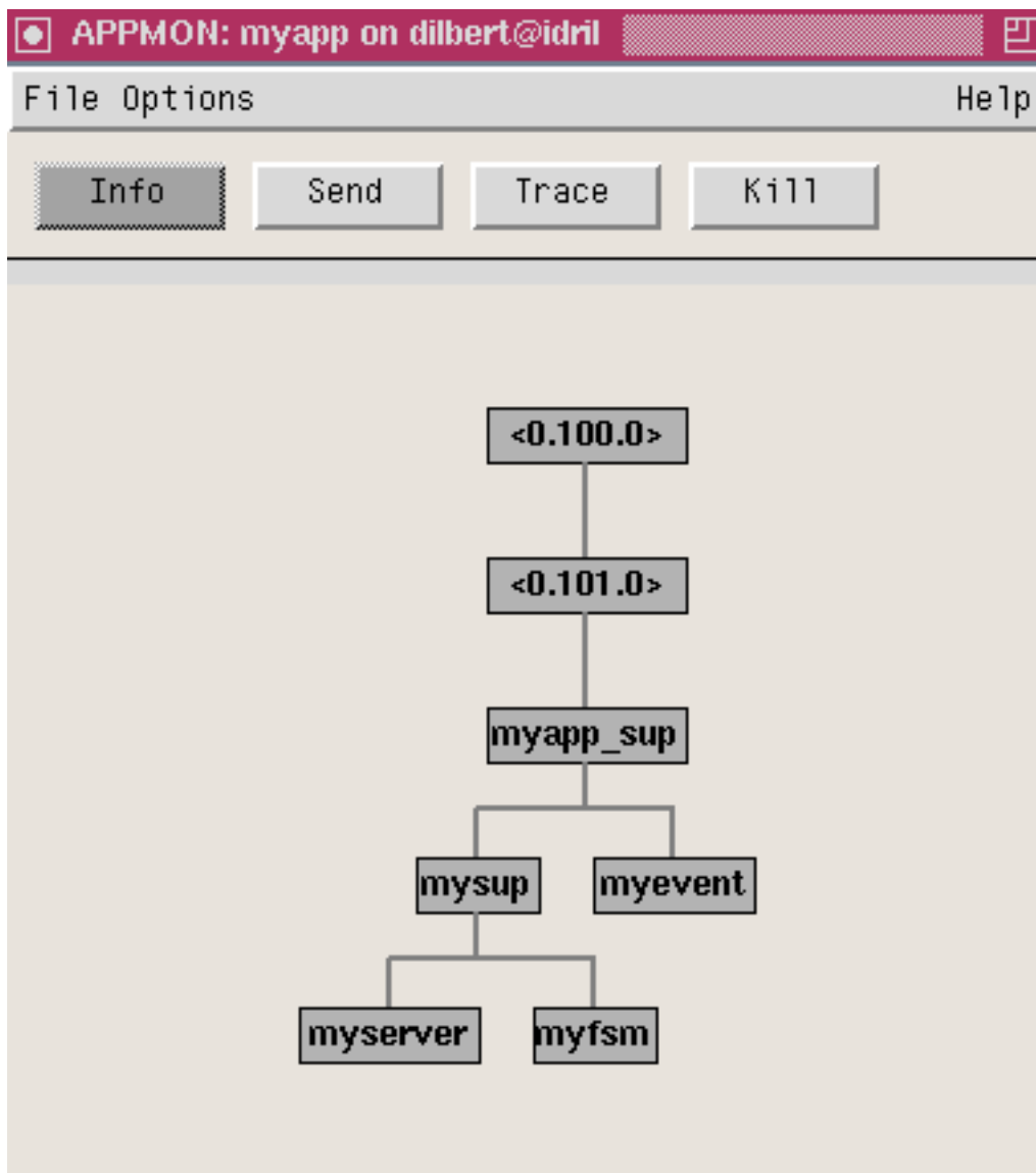
Figure 1.2: The Application Window.

The application can be shown either as a strict supervision tree, or as a process view with all linked processes. In supervision mode, the tree-gathering and -building algorithm assumes conformance to the OTP design principles.