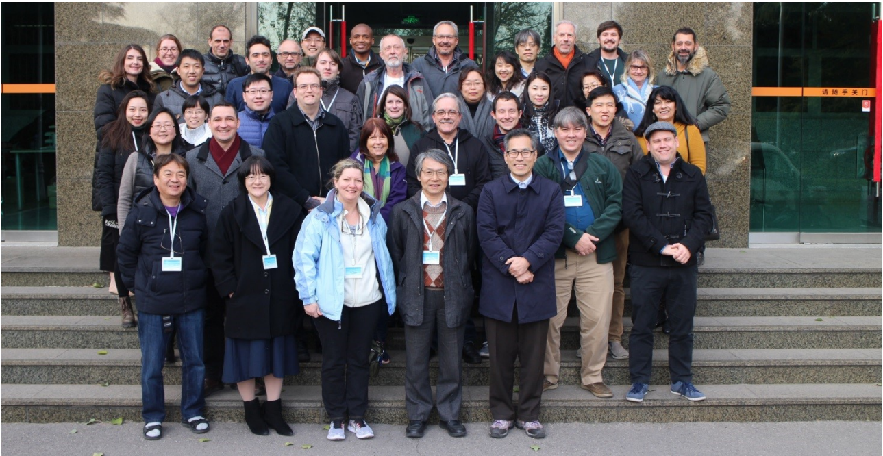
Figure 2: Example of a full-width figure showing the JACoW Team at their annual meeting in November 2017. This figure has a multi-line caption that has to be justified rather than centred.

The names of authors, their organizations/affiliations and postal addresses should be grouped by affiliation and listed in 12 pt upper- and lowercase letters. The name of the submitting or primary author should be first, followed by the coauthors, alphabetically by affiliation. Where authors have multiple affiliations, the secondary affiliation may be indicated with a superscript, as shown in the author listing of this paper. See ANNEX A for further examples.