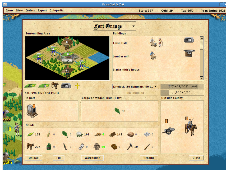
Figure 3: The Colony Panel

Below the list of buildings, you can see four elements related to the production of buildings and units. At the top left, a select box allows you to select the building or unit you wish to build. The button at the bottom left allows you to buy the selected building or unit instead of building it. The two progress bars to the right show you how many hammers and tools are required to finish the selected building or unit, how many hammers and tools you have already produced, how many will be produced in the next turn, and how long it will take until all necessary goods have been produced.